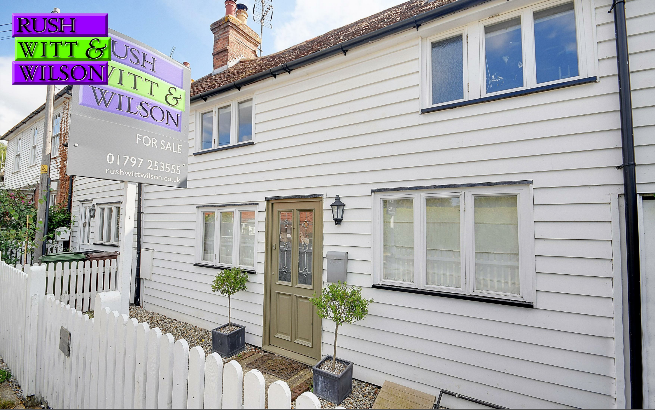
Meadow View Cottage, Main Street, Beckley, East Sussex, TN31 6TL. £325,000 OIEO

RUSH WITT & WILSON FOR SALE 01797 253555 rushwittwilson.co.uk